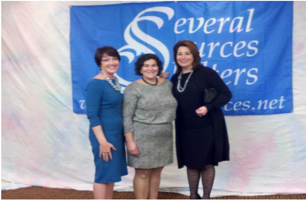
Celebrating 30 years with Several Sources