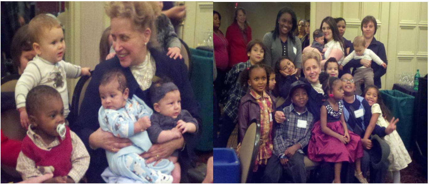
Sheltering woman who are pregnant while fostering and educating